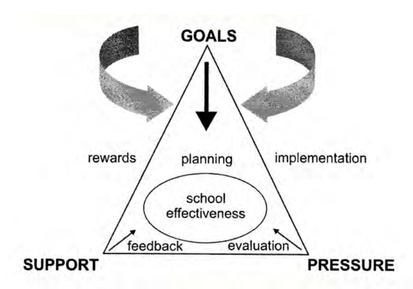
Figure 3 TCA : Assessment framework based on the contextual factors of goals, pressure and support in pursuit of school effectiveness (adapted from Sun et al. , 2007:98)

In recent research on school effectiveness (Sun et al. , 2007; Creemers & Kyriakides, 2008; Kyriakides et al. , 2008a; Kyriakides et al. , 2008b; Van Damme, Opdenakker & Landeghem 2008), the authors emphasise, among other things, aspects such as national goal setting in terms of learner outcomes (i.e. learner outcomes and school effectiveness is firmly embedded in its national context), pressure in the form of strong central control and school accountability, and strong support from the community as some of the contextual factors that influence the effectiveness of schools.