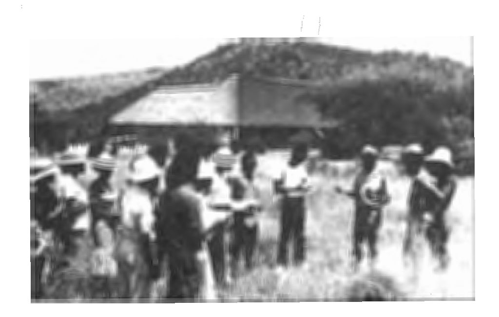
FIGURE 1 Students in the Intensive Educational Area with Gold Fields Education Centre in the background.

The essence of the educational programme at Pilanesberg National Park is to convey knowledge, understanding, a sense of aesthetic appreciation and a feeling