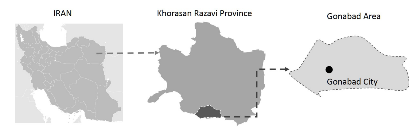
Figure 1: The location of Gonabad city in the country

ICHHTO (Iran Cultural Heritage, Handicrafts and Tourism Organization) Khorasan Razavi province requested the documentation of the historic core of the city based on the architectural elements as a research project due to the policies of the country. Therefore, the research took the position in the city based on the documentation of the historic elements in the city, which located in the northeast of IRAN, as shown in Figure 1.