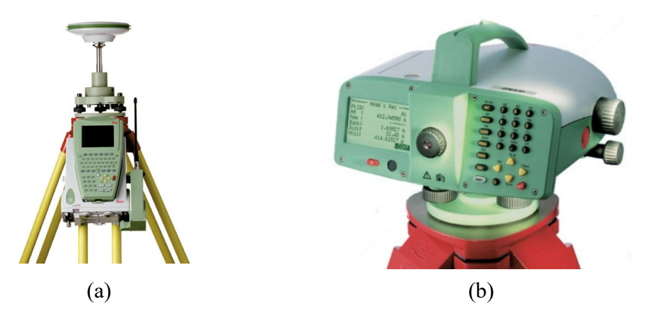
Figure 2. (a) Leica 1200 Differential GNSS Set-up (b) Leica DNA 03 Digital level