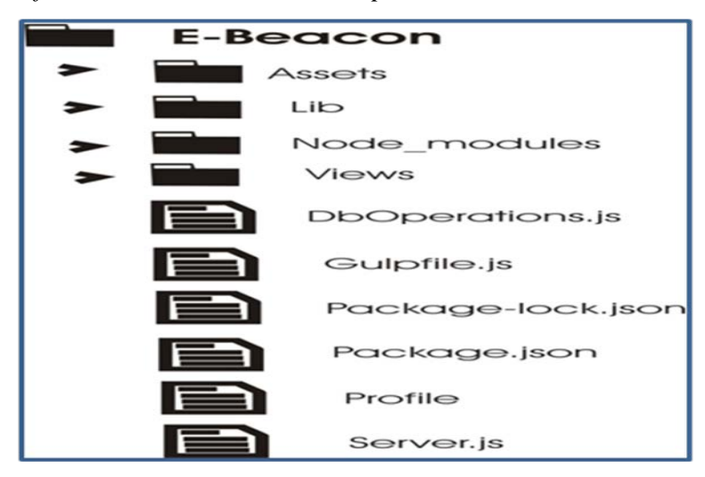
Figure 2. Directory Structure of the Application

The Main logic happens in package.json which defines the whole server, includes important dependences and connects routes. The route folder describes different endpoints. The endpoints in route folder use helpers from utility folder. The Model folder consists of mongoose models. Mongoose is an ORM (Object Relational Mapping) wrapper for talking to MongoDB. MongoDB is very flexible and does not enforce the developer to have a database scheme defined. MongoDB allows changing the database schemer on the fly, by adding new keys without any over head.