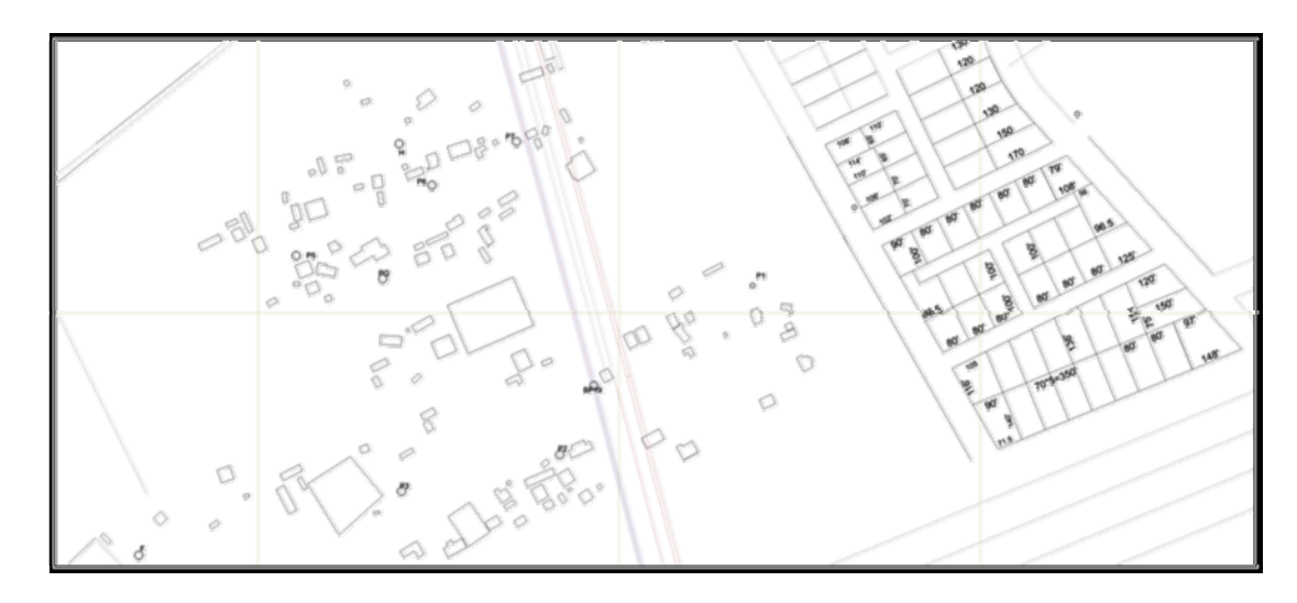
Figure 3: Sample of unplanned encroachments in Community 23

In another development, the Nungua Stool sued the Attorney-General (A-G) and TDC at the Lands Division of the High Court seeking an order for the release of land for a hospital. The Stool is seeking to place an order of perpetual injunction to restrain TDC from entering the land (Myjoyonline, 2012).