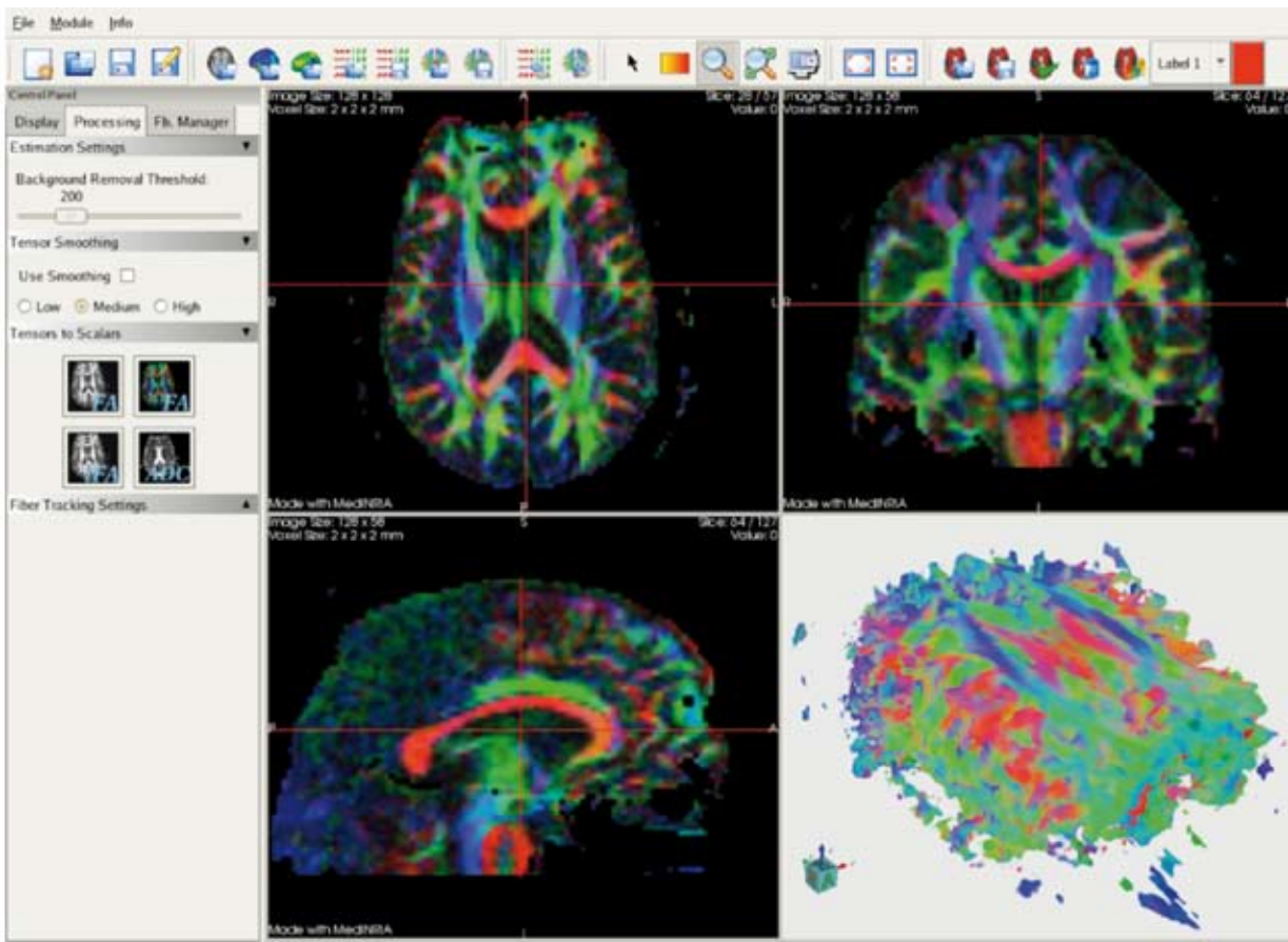
Fig. 1. DTI tractography showing axial, sagittal and coronal views in an individual patient. Areas shaded green represent white matter tracts from anterior to posterior, those in blue inferior to superior, those in red, from left to right. It is possible to isolate regions of interest, or to detect areas where significant abnormalities in integrity of white matter occur.