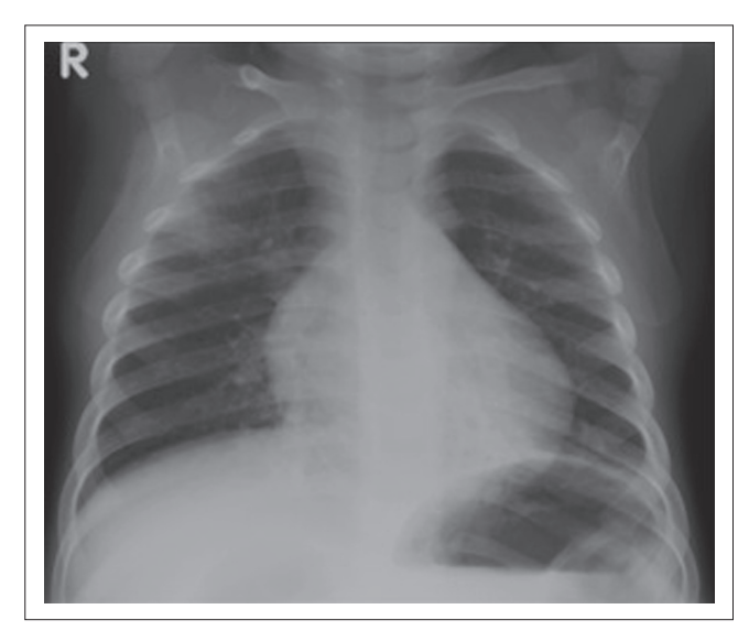
FIGURE 1: Chest radiograph on admission, with features of bilateral pneumonia.

was changed to ertapenem and fluconazole for presumed hospital-acquired infection. There was no growth on blood culture after 5 days of incubation, and a urine culture yielded mixed bacterial growth. Tuberculin skin testing (Mantoux method) and Xpert MTB/RIF (Cepheid, Inc., Sunnyvale, CA, USA) on induced sputum specimens were negative. Two days later, he had generalised tonic clonic seizures for which he received an intravenous loading dose of phenobarbitone. The antibiotic was empirically changed to meropenem for possible hospital-acquired meningitis. A cerebrospinal fluid specimen was bloodstained but there was no bacterial growth, and polymerase chain reaction (PCR) assays for entero- and herpesviruses were negative.