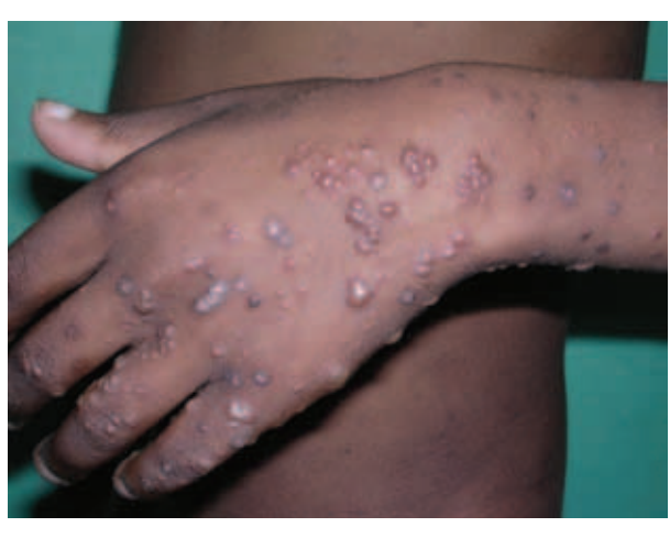
Fig. 3. Herpes zoster.

Latent VZV infection can present with a clinical pattern of scattered vesicles in the absence of dermatomal herpes zoster.