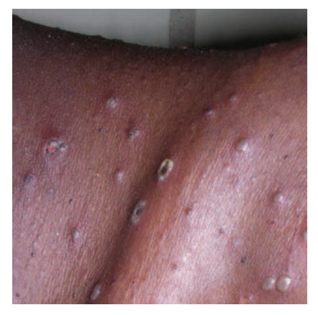
Fig. 6. Chickenpox.

In chickenpox, the rash presents as a vesicular eruption on an erythematous base which may become pustular and crusted (Fig. 6). The rash tends to involve the face and trunk more than the limbs. In HIV it tends to become more dense and more extensive, may ulcerate and may involve systemic organs. Chickenpox may be confused with disseminated HSV infection or disseminated zoster. Especially in children. it may be an extensive mucocutaneous disease with repeated new crops of vesicles, which may necrotise and become haemorrhagic. If left untreated this has a high mortality in immune-suppressed individuals. Even though the diagnosis is usually made on clinical findings alone, when in doubt isolation of virus on viral culture from vesicular skin lesions confirms the diagnosis. Cytological examination of fluid or scraping from the base of a vesicle or pustule (tzanck smear) shows both giant and multinucleated epidermal cells, but cannot differentiate from herpes zoster or HSV infection. The following complications may occur and are seen more frequently in immunocompromised individuals: hepatitis, pneumonitis, encephalitis, and less commonly arthritis, carditis, nephritis and orchitis.