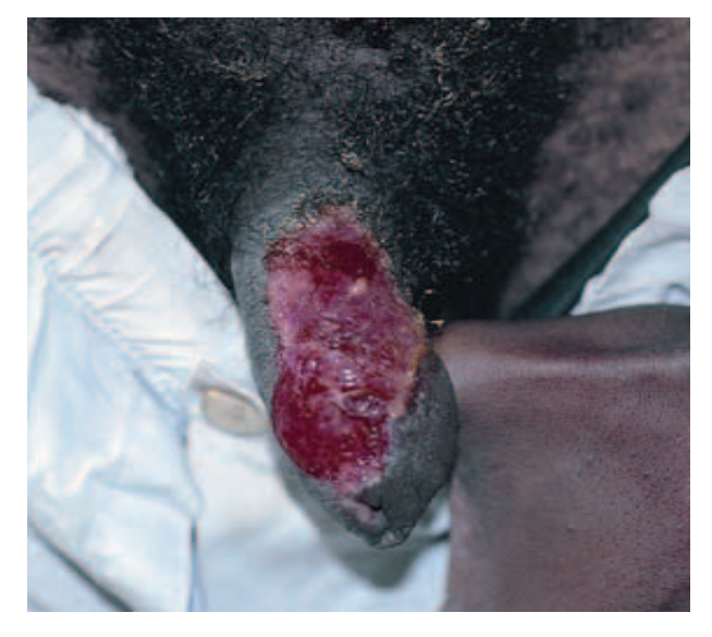
Fig. 2. Herpes simplex ulcerating penile lesions.

Variations in clinical manifestations can occur as a result of the location of the lesions. Genital HSV infection can manifest as oedema, ulcers, crusts, fissures, erythematous