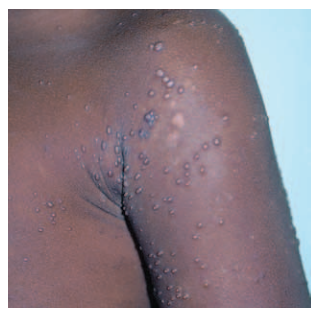
Fig. 7. Molluscum contagiosum.

Molluscum contagiosum is a common infection in HIV and typically presents with umbilicated flash-coloured, domeshaped lesions (Fig. 7). In most cases molluscum contagiosum is self-limiting, and in adults it is most often sexually transmitted. It is seen more frequently in the paediatric population. In AIDS patients, molluscum contagiosum lesions can be widespread, attain immense size (giant molluscum) (Fig. 8) and have unusual locations.