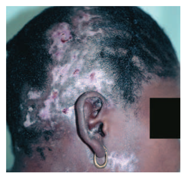
Fig. 4. Post-herpetic scarring (PHN).