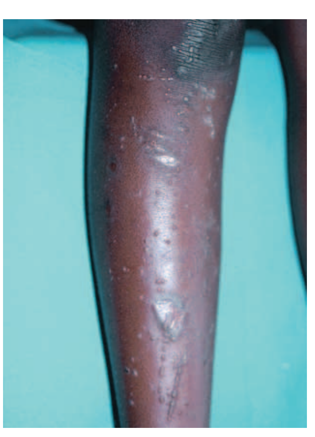
Fig. 12. Verruca planar (epidermodysplasia verruciformis-like lesions, shins).