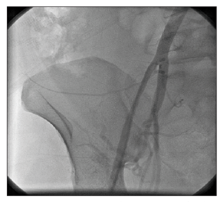
Fig. 3. Angiogram showing no further bleeding.

Getting on with what works. Lancet 2006;368(9543):1284-1299. [http://dx.doi.org/10.1016/S0140-6736(06)69381-1]