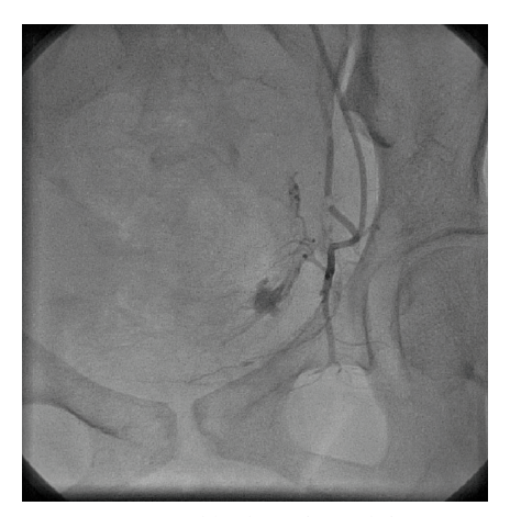
Fig. 1. Active bleeding from left uterine artery.

During pregnancy the uterus, vagina, and vulva have rich vascular supplies that are at risk of trauma during the birth process; trauma to these highly vascular areas may result in formation of a haematoma. Puerperal haematomas occur in 1:300 - 1:1 500 deliveries and, rarely, are a life-threatening complication of childbirth.<sup>[10,11]</sup> Vaginal/paravaginal haematomas result from injuries to branches of the uterine artery, mainly the descending branch.<sup>[12]</sup> These haematomas are usually