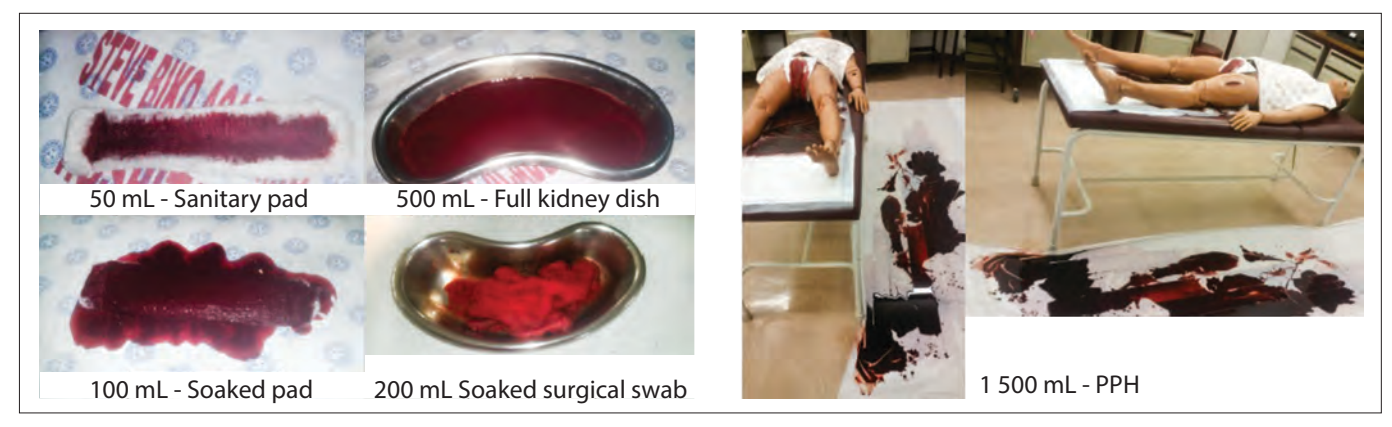
Fig.1. Visual aid with known blood volumes. (PPH = postpartum haemorrhage.)

to introduction of the intervention in November 2015. This OSCE had 5 stations with the following volumes of blood: