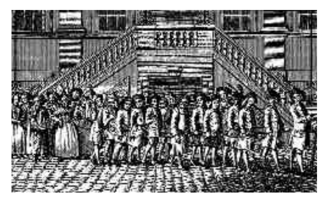
Fig. 4. Convicts in chains await transportation to prison colonies abroad (1770s).

remote colonies, in particular Australia and the eastern provinces of Russia. Another version of this practice, employed by wealthy families, was the remittance man. The black sheep of the family would be despatched to the colonies, with a small monthly allowance, on the understanding that he would not return home.