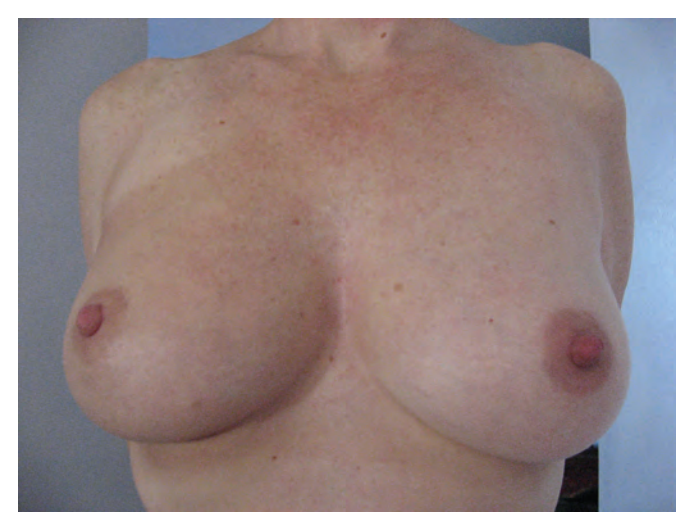
Fig. 4. The patient's cosmetic result.

a mastectomy. Her final histology showed 3 discreet lesions, which corresponded to those seen on ultrasound: 12 mm, 8 mm and 10 mm lobular carcinoma (Fig. 2).