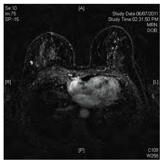
Fig. 3. The MRI scan overcalled a benign-looking lesion.

A 40-year-old woman presented with a mass in her left breast. Clinically the mass was consistent with a benign process. Her mammogram was unhelpful and her sonar showed 3 discreet similarlooking masses; the largest was noted to be 11 mm. Tru-cut of the palpable lesion confirmed the diagnosis of lobular carcinoma. FNA of the other lesions was not diagnostic. MRI scan showed a single large lesion 87 x 44 mm. On the basis of the MRI findings, the patient had