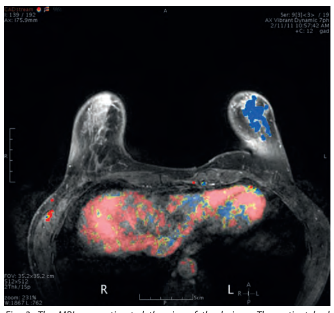
Fig. 2. The MRI over-estimated the size of the lesions. The patient had appropriate surgery.

The conclusions from the COMICE trial were that (i) the rate of reoperation for BCT was unchanged by pre-operative MRI, and (ii) that all MRI lesions seen must be biopsied.