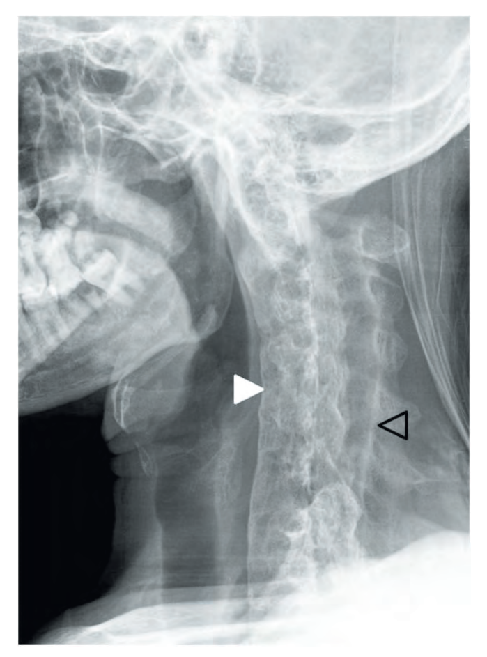
Fig. 2. Lateral cervical spine X-ray. The white arrowhead indicates syndesmophytes, representing calcification of the anterior portion of the annulus fibrosis. Calcification of the interspinous ligaments can also be seen (open arrowhead).

These appear as irregularities and erosions of the vertebral endplates (Fig. 1), not related to the anterior or posterior edge but rather to the central portions of the intervertebral discs. These are better visualised by MR images of the spine, but can be seen on conventional X-ray and are indicative of active inflammation.<sup>1</sup>