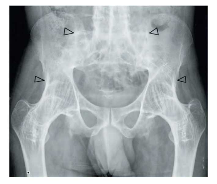
Fig. 4. Antero-posterior view of the pelvis. The open arrowheads indicate marked ankylosis of the hips and sacro-iliac joints.