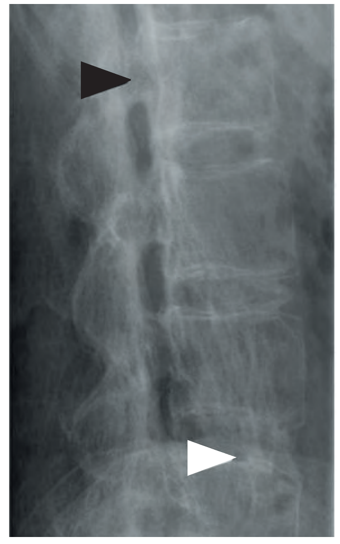
Fig 1. Lateral lumbar spine view. Note the 'squaring' of the lumbar vertebrae (open arrowhead), together with the central radio-dense region in the vertebral endplate of the 5th lumbar vertebra, superiorly (white arrowhead). This is known as an Andersson lesion.