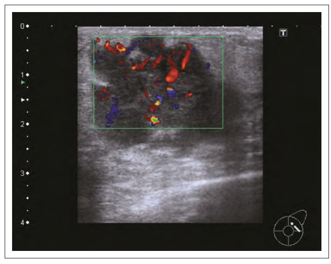
FIGURE 2: Ultrasound image of the hypoechoic mass in the left breast demonstrating posterior enhancement and increased vascularity.

The risk for KS in acquired immunodeficiency syndrome (AIDS) patients is estimated to be 20 000 times greater than the general population and 300 times greater than in other immunocompromised populations.<sup>5</sup>