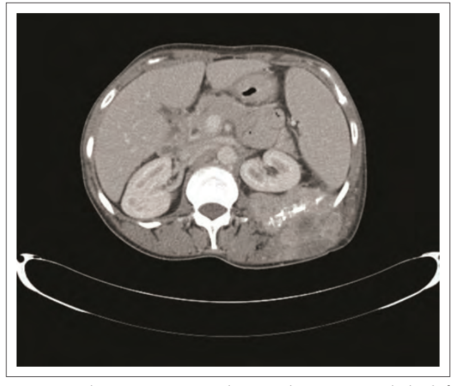
FIGURE 3: Axial post contrast computed tomography scan image at the level of the 12th rib demonstrating the destruction of the left rib with surrounding soft tissue mass.

Frequently KS manifests in mucocutaneous sites, typically the skin of the lower extremities, face, trunk, genitalia and