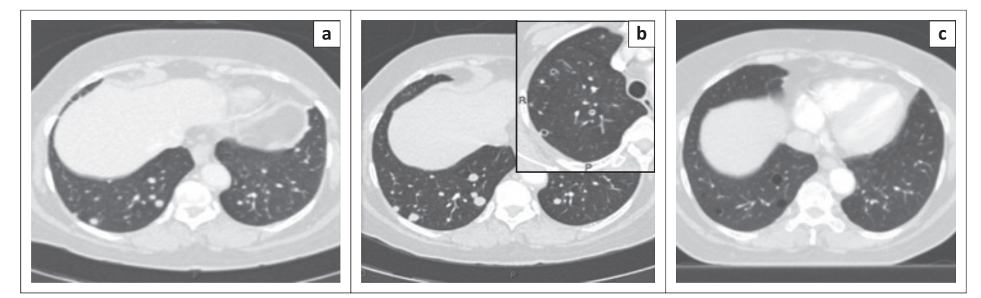
FIGURE 2: Consecutive computed tomography axial image series through the lung bases eloquently depicts the temporal evolution of: (a) solid pulmonary nodules to (c) thin-walled cysts. The magnified insert clearly demonstrates the central cavitation (b).

The evolution of solid pulmonary metastases to cavitating and then cystic lesions, as a consequence of therapy, is a fairly rare entity albeit an important one to consider. The possibility of spontaneous pneumothorax is an uncommon but significant complication, which requires interval clinical and