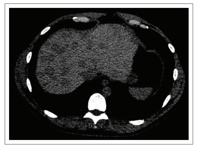
FIGURE 1: Non-contrast CT imaging of the chest revealed a multinodular ('patchy') pattern of the lesions in the hepatic parenchyma.

Chest CT was performed independently at another clinic. A CD archive of the CT scan without contrast enhancement was provided for a second-opinion. CT analysis demonstrated no pathological changes in the lung parenchyma. At the lower margin of the field of view, a heterogeneous liver parenchyma was noted with numerous variable-sized hypodense nodular foci of round or oval shape in an unequal distribution. The maximum diameter was 2.5 cm. Density reading of these liver lesions was about +30 HU (absolute low attenuation), with background liver parenchyma density measuring +50 HU. Furthermore, there was no associated mass effect. Vascular structures (hepatic veins and portal branches) traversed the nodules without disruption (Figure 1). The obvious etiological identity of the lesions was not determined. In accordance with the data from the CT scans, elastography for assessment of the degree of liver fibrosis, MRI with contrast for further characterisation of the nodules and evaluation of the laboratory profile was planned.