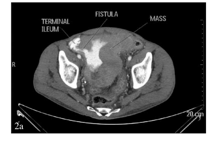
Fig. 2. Axial (2a) and coronal (2b) post-contrast CT, venous phase, showing communication between contrast-containing mass and terminal ileum.