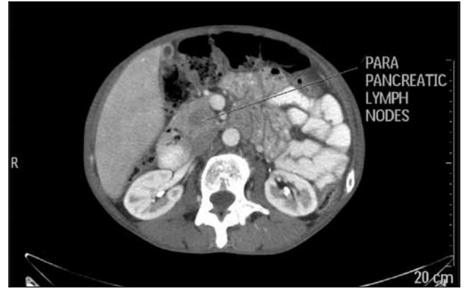
Fig. 3. Axial post-contrast CT scan, venous phase at the level of the kidneys, showing large para-pancreatic lymph nodes with central low density.

pain, dysphagia, small bowel obstruction, haematemesis and melena. Symptoms are usually identical to those caused by primary GI tumours.<sup>4,6</sup>