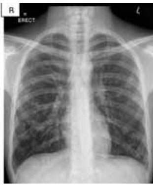
Fig. 2. Chest X-ray of metastatic liver cancer. (A) Pre-treatment: Note numerous bilateral solid nodules, and (B) Post-treatment: Note numerous bilateral pulmonary nodules that have decreased in size and density with associated cystic degeneration owing to chemotherapy.

Restaging examinations included a chest and abdominal CT. Numerous cystic metastatic lesions were detected bilaterally throughout both lung fields secondary to systemic treatment. Bilateral pneumothoraces were present (Fig. 2). A single hypodensity was detected in the periphery of the right lobe of the liver but was, however, too small to characterise and could represent either a benign cyst or a cystic metastasis. The remainder of the abdomen was clear. Currently, the patient continues with second-line multi-agent chemotherapy on a weekly basis.