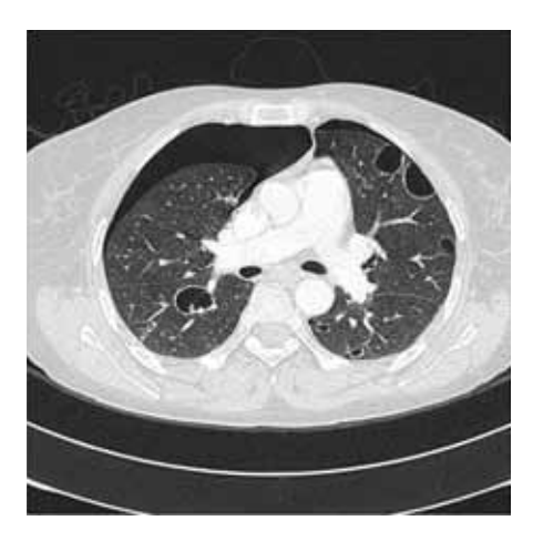
Fig. 3. Lung CT of a patient with metastatic epithelioid trophoblastic tumour (ETT). Note the irregular thin-walled cystic structures with ruptured subpleural lesions, resulting in bilateral pneumothoraces.

Restaging examinations included a chest and abdominal CT. Numerous cystic metastatic lesions were detected bilaterally throughout both lung fields secondary to systemic treatment. Bilateral pneumothoraces were present (Fig. 2). A single hypodensity was detected in the periphery of the right lobe of the liver but was, however, too small to characterise and could represent either a benign cyst or a cystic metastasis. The remainder of the abdomen was clear. Currently, the patient continues with second-line multi-agent chemotherapy on a weekly basis.