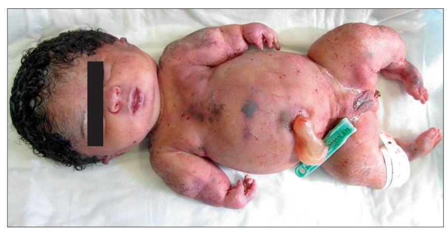
Fig. 1. A female fetus was stillborn at 34 weeks' gestation, with a birth length less than the 3rd centile and an upper:lower segment ratio of 2.25 (increased). The following dysmorphic features were noted: soft skull, blue sclera, prominent beaked nose, small mouth, short upper limbs (both rhizomelic and mesomelic segments) and bowed lower limbs.

Osteogenesis imperfecta (OI) is a heterogeneous group of genetic bone disorders that are characterised by decreased bone mass, increased bone fragility and susceptibility to fractures. The severe, perinatal lethal form (Type II) (OMIM 166210) is characterised by bone fragility, with perinatal fractures, severe bowing of long bones, undermineralisation, and death in the perinatal period owing to respiratory insufficiency. The overall prevalence of OI Type II is unknown. There are three subtypes of OI type II (A, B and C) that are characterised by different radiological features, and may be caused by different genetic faults.1 Two fetuses with OI Type IIA are presented. As there is no molecular genetic testing currently available