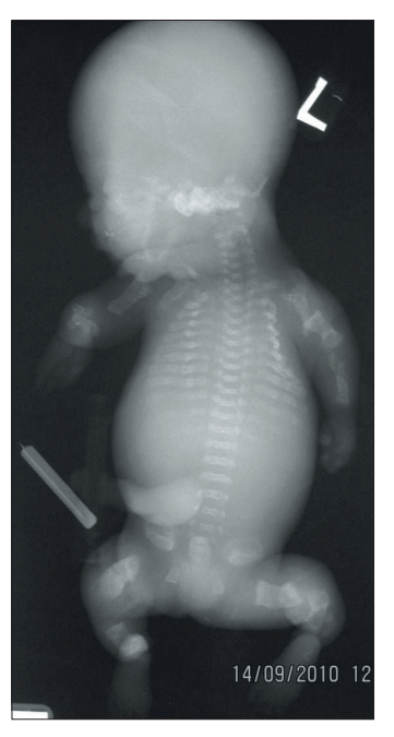
Fig. 3. Babygram X-ray of Patient demonstrating generalised undermineralisation and evidence of multiple fractures. The skull is poorly ossified. The ribs show continuous beading. All long bones are short and broad with crumpled shafts.

OI Type IIA is an autosomal dominant condition caused by mutations in the collagen 1 alpha-1 chain (COL1A1) and collagen 1 alpha-2 chain