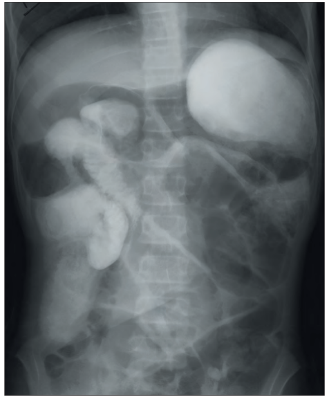
Fig. 3. Iodine contrast meal and follow-through (delayed images). A collection of small-bowel loops is noted in the right hypochondrium.