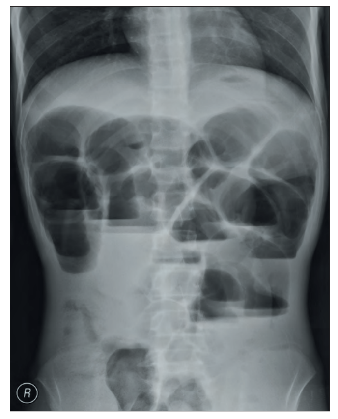
Fig. 1. Erect abdominal radiograph demonstrates dilated proximal small-bowel loops with multiple dynamic air-fluid levels in keeping with proximal small-bowel obstruction.

done well and has had no further recurrence or further symptoms or complications.