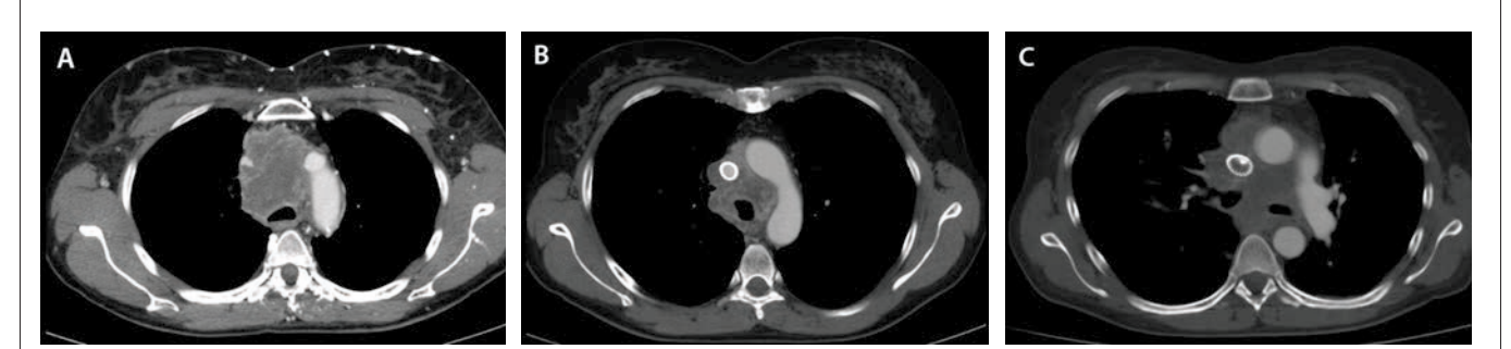
Fig. 4. (A) A central, small cell lung cancer in the upper mediastinum with encasement of mediastinal structures, in particular the superior vena cava. In the area of the chest wall, especially on the left side, an increased venous drawing is visible at skin level. (B) Follow-up computed tomography (at 3 months) after stent implantation. The stent in the superior vena cava is in the correct position and the vascular lumen is free perfused. (C) Follow-up computed tomography (at 6 months) after stent implantation. Restensis of the superior vena cava by progression of tumour growth, in particular through the stent mesh. A planned re-intervention was not performed because the patient died from the consequences of the disease.

our study, as the available stent sizes enabled complete coverage of the obstruction with one stent in each case.