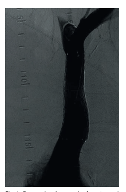
Fig. 3. Cavography after stent implantation and balloon angioplasty. Presentation of the stented uncaged superior vena cava with correct stent position and a regression of collateral circulation.

Corresponding to the stenosis, a selfexpanding Nitinol stent was placed. Despite the high radial expansion force of the stent, residual tumour-related constrictions were subsequently dilated with a balloon (Zelos, Optimed, Ettlingen, Germany) in all patients for optimisation in the area of the stenosis. A non-compliant balloon was used, which was chosen to be slightly smaller in relation to the stent diameter and with a length of 40 mm. A stent with a diameter of 20 mm was subsequently dilated with the aid of a balloon with a diameter of 18 mm, without exceeding the working pressure of 4 bar. Accordingly, a 20 mm balloon was used for a 22 mm stent. The stent length and the diameter were determined on the basis of the CT and cavography. The stent length was chosen according to the stenosis. The stent diameter was determined on the basis of the diameter of the SVC in the normal calibre range, taking into account respiratory variability (Fig. 2).