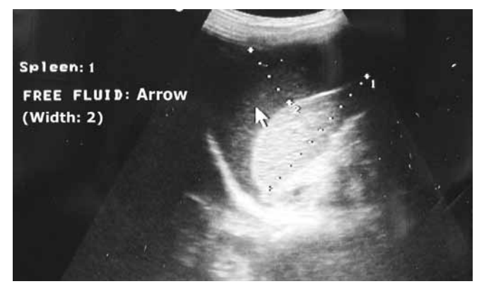
Fig. 3. Sonar image showing haematoma (arrow) around spleen.

collection (slightly echogenic, consistent with haematoma) was shown surrounding the spleen (Fig. 3). Although there was no visible splenic injury, a presumptive diagnosis of splenic rupture was made and the patient underwent immediate laparotomy. This revealed a rupture of the pancreas with extensive retroperitoneal and also intraperitoneal haemorrhage. The spleen was found to be intact.