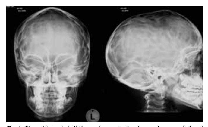
Fig. 1. PA and lateral skull X-rays demonstrating impressive convolutional markings (copper-beaten skull appearance) in a 6-year-old girl with known craniosynostosis. Note associated fusion of the saggital, coronal and lamdoid sutures.

A 6-year-old girl with known craniosynostosis graphically demonstrates the copper-beaten skull on plain radiography (Fig. 1).