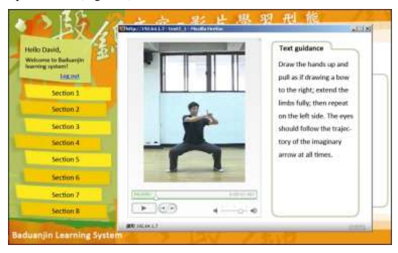
FIGURE 1. INTERFACE OF LEARNING SYSTEM FOR VIDEO GROUP

The Baduanjin learning system used here was designed by, first, filming the demonstration of an expert who has been practising and coaching Baduanjin for more than 10 years. The video content was separated into 8 pieces corresponding to the 8 sections of Baduanjin. The narration of the expert was transcribed into text and the researchers examined the text information for the 3 groups to make sure that they were identical. Students in the video group could watch the video clip and read the text guidance. They could also pause and replay the clip if needed (Figure 1).