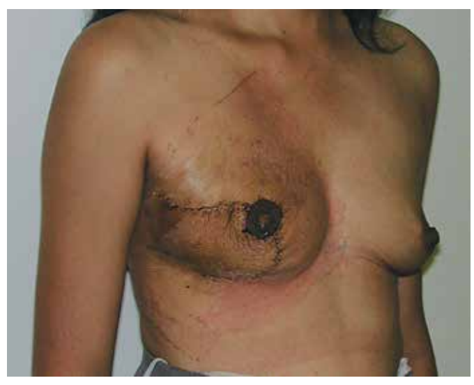
Figure 2c Case 2 at 1 week postoperatively showing the mastopexy closure, NAC reduction and satisfactory breast outcome.

carrying flap, with overlying skin, was designed to be carried on an inferolateral blood supply (Figure 2a). Inferomedial to the NAC pedicle, a crescent of skin was de-epithelialized (Figure 2b). The breast mass with its overlying ulcer and surrounding ellipse of skin, superior to the NAC pedicle, was excised. In closing the created wound, the NAC carrying pedicle with overlying skin filled the outer quadrant defect created by the removal of the mass. An early postoperative result in this case showed a good result (Figure 2c).