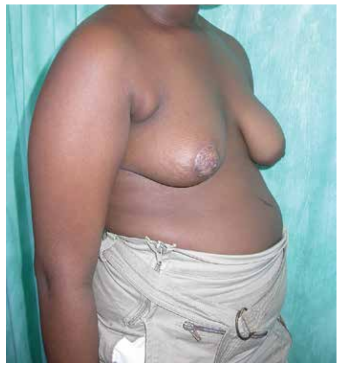
Figure 1c Case 1, at 1 month postoperatively shows a relatively good match to the opposite breast.

Case 1, shows a de-epithelialized central keyhole zone of the wise pattern and the entire lower quadrant. An incision below the nipple areola complex (NAC) carrying pedicle delivers the tumour mass for removal.