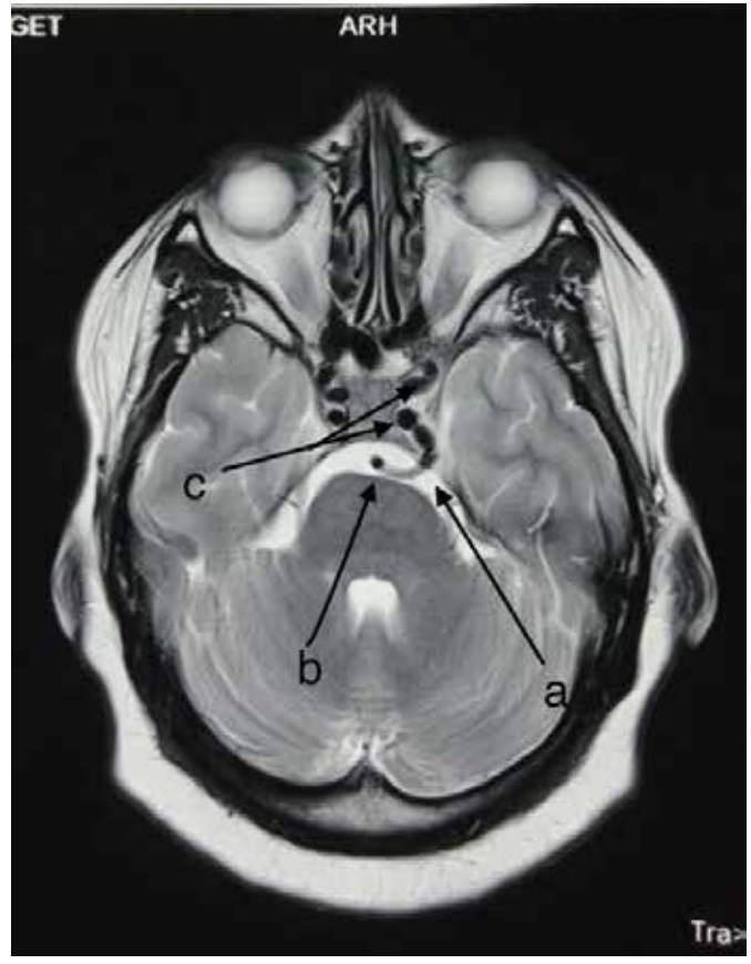
Figure 2. MRI T2Wi image, showing a left PPTA, no evidence of tumour, thrombosis or aneurysm a – PPTA