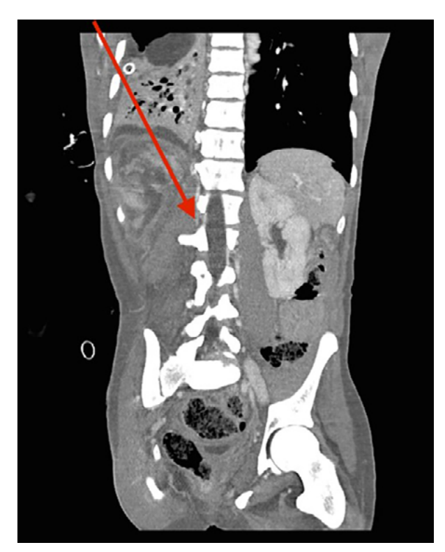
Figure 2: Coronal view of the injured liver; red arrow denotes bullet tract

This case highlights several aspects of the double jeopardy dilemma. High-grade liver injuries are associated with increased morbidity and mortality. Postoperative morbidity is mostly associated with the development of biliary