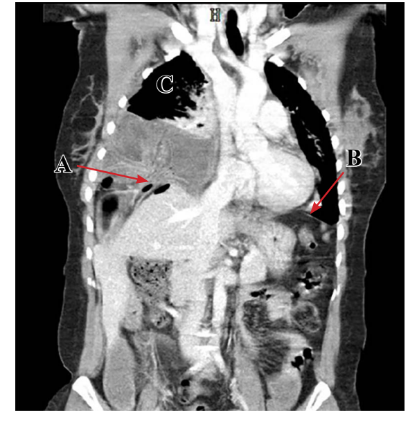
Figure 2: Preoperative CT thorax/abdomen showing right sided diaphragmatic hernia

A – Right-sided diaphragmatic defect with large bowel present in the thorax