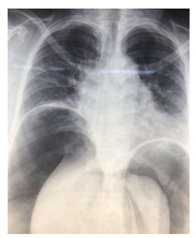
Figure 4: Post-PPP chest radiograph illustrates a significant pneumoperitoneum, splinting of the diaphragm and atelectasis

(range 5.5–12.4). The mean defect size was 15.8 cm (7–25). At electasis from the PPP is shown in Figure 4. The mean pre-deflation and post-closure PAP were 21 and 20 cm \rm H_2O respectively, confirming that R1 and R2 are nearly the same. There were three instances of surgical site complications, two surgical site sepsis and one abdominal wall hematoma. The intraperitoneal catheter was inserted uneventfully in all cases. Only one patient spent a day in ICU due to an unexpected intraoperative bronchospasm. In one other case, there was an intraoperative iatrogenic injury of the herniated bowel and floppy bladder that were successfully repaired.