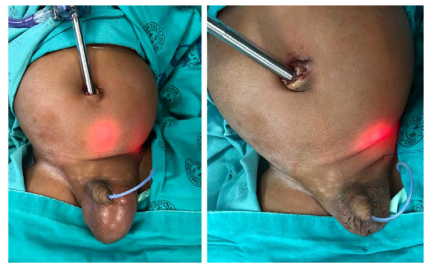
Figure 2: Pneumoscrotum does not recur post PIRS as indicated by image on right

suture remained for ease of passage. An 18-gauge spinal introducer needle was flushed with saline before the suture is passed through it and brought out the tip of the needle to create a loop. The needle and looped suture are introduced via the skin stab and passed under laparoscopic visualisation around the lateral wall peritoneum of the internal ring (Figure 1). The loop was pushed further into the abdominal cavity. Care was taken to avoid the vas and vessels. The needle was then removed while retaining the loop within the abdominal cavity. The needle was then passed via the