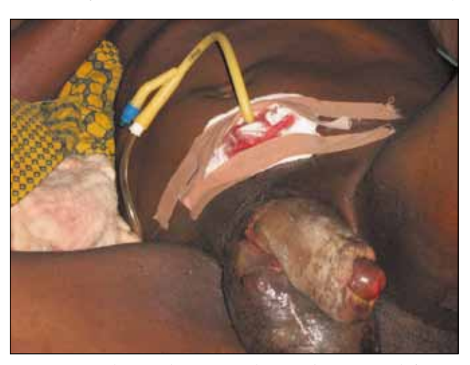
Fig. 1. Penoscrotal Fournier's gangrene with suprapubic cystostomy before debridement.

Fournier's gangrene is no longer considered idiopathic, because the pathological features are well defined and the portals of entry