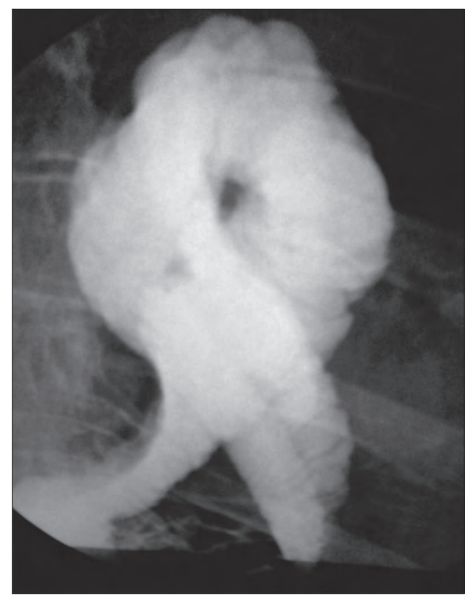
Fig. 3. Herniated bowel demonstrating the 'ribbon sign'.

Reduction of the herniated contents and definition of the hernial neck were facilitated by a midline laparotomy. Ischaemia of the large bowel and mesentery was noted. A colonic perforation was present at the splenic flexure, with gross faecal contamination of the peritoneal cavity. The respective colonic segment from transverse colon to splenic flexure and mesentery was resected.