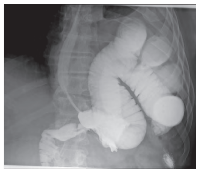
Fig. 4. Dilated bowel in the left hemithorax.

Herniation of intra-abdominal contents into the chest may be particularly difficult to identify on contrast studies. The relationship of the respective positions of the hernia and diaphragm needs to be actively examined. I propose that a 'ribbon sign' suggests the presence of a loop of incarcerated torted bowel. Subsequent strangulation and perforation is the natural history.<sup>[5]</sup> Herniation of other abdominal structures is likely to co-exist. Pleural collections are not specific to strangulated bowel, but increase the likelihood of its presence. Fluid leaking from oedematous bowel drains directly into the pleural space. This has prognostic implications, so surgery must be performed as a matter of urgency even if the patient appears well.