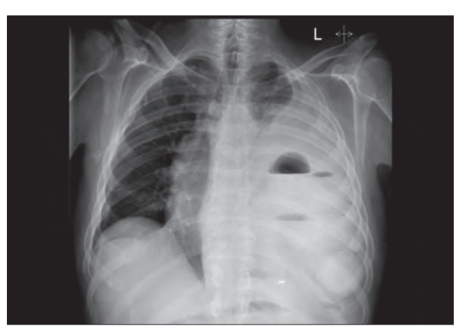
Fig. 1. Postero-anterior chest radiograph.

The hernia was approached via a left posterolateral thoracotomy and the pleural space was entered through the 7th intercostal space. The contents of the hernia included mainly large bowel, small bowel and its associated mesentery. The hernial mass was adherent to a cortex-free left lower lobe. Only a moderate amount of turbid fluid was present in the pleural space.