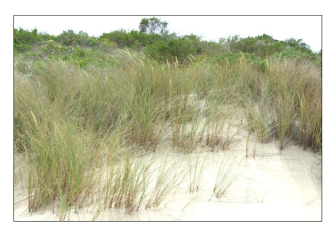
Figure 2: Ammophila arenaria (marram grass) at Oyster Bay being replaced by shrubs with coastal scrub in the distance.

in numerous regions, sometimes over >100 ha in extent, by the then Department of Forestry as part of an extensive stabilisation programme of mobile dune systems.<sup>8</sup> These stabilisation programmes were often inappropriate as dune studies at Rhodes University and the Coastal Research Unit at Nelson Mandela University only later showed. At this time, Roy Lubke and Ted Avis published their illustrated pamphlet.<sup>1</sup>