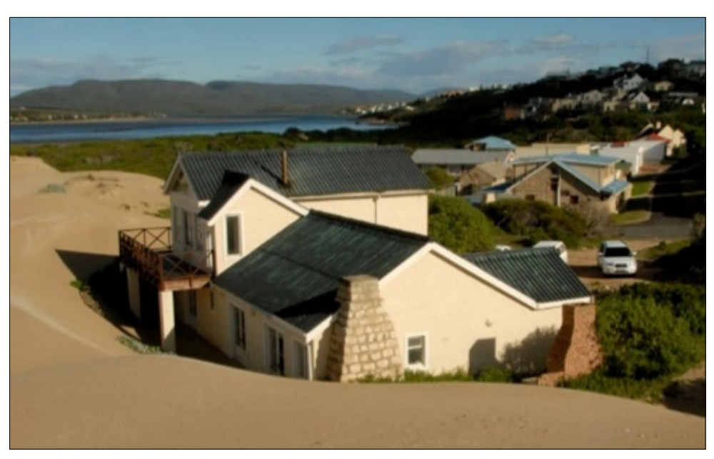
Figure 1: A property at Witsand on the southern Cape coast.

Imagine having purchased a beach house along the Cape coast on a fine summer day to spend family holidays relaxing and enjoying South Africa's marvellous coastal environment. Then, on a visit to the beach house in the winter, when a strong southeasterly wind is blowing, you find that the dunes that naturally migrate along the shore are approaching your house at a rapid rate. When you approach a local environmental consultant, they assure you that, with permission from the authorities, you can stabilise the dune system and divert those sands away from your property.