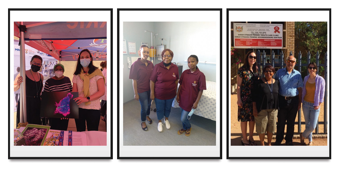
Figure 2: Human genetics research is built on community participation and collaboration. As part of our research, local clinics were better equipped and community members were trained to assist with recruitment. Pictured here are study co-investigators, the study nurse and community members involved in recruitment.

Our study highlighted the critical role that DNA from contemporary Africans can play in understanding deep human history. By integrating the genetic data of a large number of contemporary individuals and groups, we can better anticipate and explain genetic variation in presentday individuals, allowing us to apply these models to health-related research concerns. There is clearly still much to be learnt by focusing on genetic data from contemporary individuals, especially when ancient DNA – crucial in revealing intriguing history and answering important concerns – may not exist for the relevant time periods, as is typically the case in Africa. Overall, our results contribute to a better understanding of human, and specifically African, population history and highlight the limitations of simplistic models, encouraging the re-evaluation of previous interpretations of genomic and fossil data.