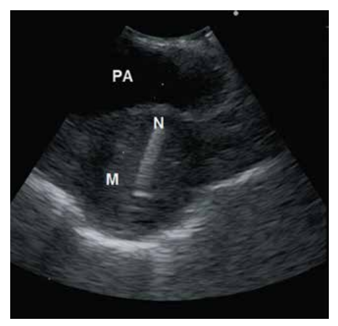
Fig. 2. An endobronchial ultrasound image, showing a mass (M) with a needle (N) during fine-needle aspiration. The needle is bypassing the pulmonary artery (PA).

bridged by the longer EBUS needle to traverse safely between the major vessels, a window of <10 mm, and obtain a fine-needle aspirate of the mass. The result, which proved to be a keratinising squamous carcinoma (Fig. 3), was most likely of supraglottic origin. The patient was discharged the same day, with a follow-up appointment to see an oncologist.