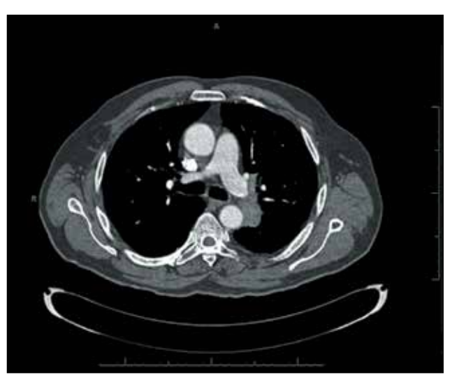
Fig. 1. A CT scan showing a heterogeneously enhancing soft-tissue mass in the posterior segment of the left upper lobe, adjacent to the proximal descending thoracic aorta, with a tissue plane between the mass and mediastinal structures appreciated. The mass also demonstrated encasement of the main left pulmonary artery.

a cytological diagnosis, the proximity of the aorta and pulmonary arteries and the mass being 14 mm from the bronchus would have made sampling by means of this procedure near impossible. With the assistance of EBUS the mass was localised, despite it not abutting the bronchus, and the position of the major vessels duly noted on Doppler ultrasound. Under real-time ultrasound guidance (Fig. 2) the tissue plane between the mass and bronchial lumen could be