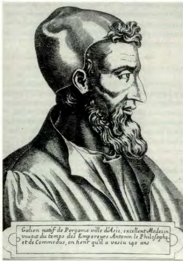
Galen's postulates (2nd century AD) regarding tumourogenesis remained dogma for 1 500 years.

Galen defines skiros (scirrhous) as a hard and painless swelling which might arise spontaneously, develop in an area of