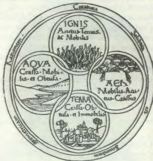
THE Classical Greek theory that all materials were made up of four "elements" persisted among philosophers—and doctors—as late as the sixteenth century when this manuscript picture was drawn.

Galen postulated that moist inflammation, inter alia responsible for tumour formation, arose from a 'flux of humours'. This entailed an abnormal congestion and mixture of these substances in response to stimuli such as fever, injury,