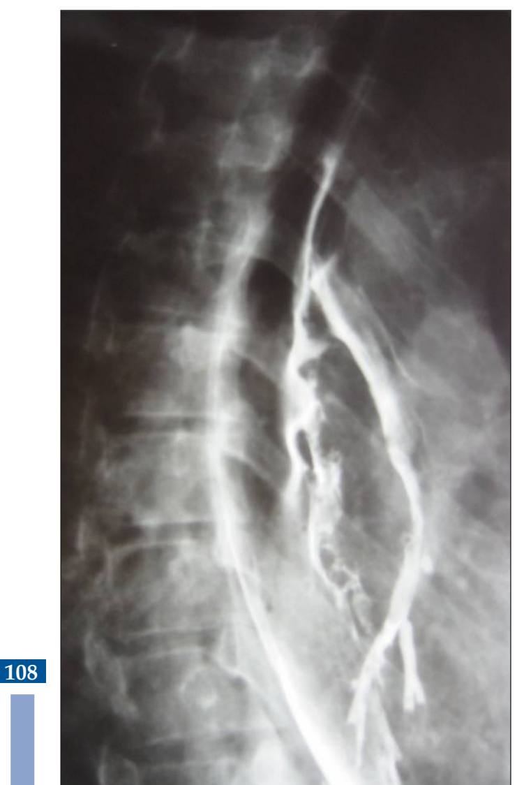
Fig. 1. Oesophago-bronchial fistula.

In our series, as in others, the most common oesophageal ulcers were idiopathic (Fig. 2) and those caused by CMV infection (Fig. 3).<sup>3,4</sup> In view of the HIV epidemic, it is surprising that so