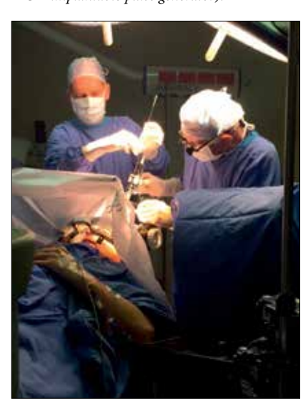
Fig. 2. The neurosurgical team placing the DBS electrode in a patient who is awake. The stereotactic frame is in situ on the patient's head.

performed again and imaging verification is done to confirm the position of the electrode in the chosen target (Fig. 4). If the placement is accepted, the implantable pulse generator (IPG) is inserted in theatre; if not, the electrode is first repositioned and then the procedure is completed. Frame-based stereotaxis is still the