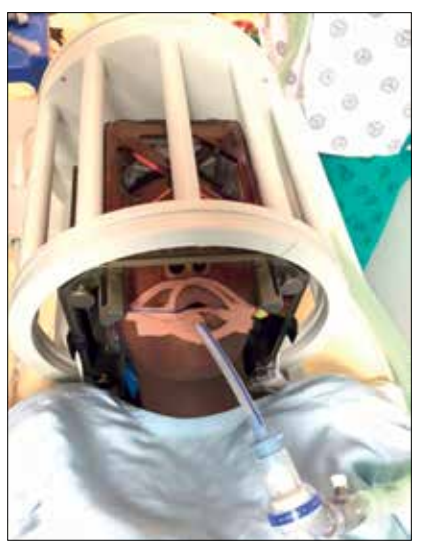
Fig. 3. A patient in the MRI head coil with stereotactic base and fiducial box on the head.

performed again and imaging verification is done to confirm the position of the electrode in the chosen target (Fig. 4). If the placement is accepted, the implantable pulse generator (IPG) is inserted in theatre; if not, the electrode is first repositioned and then the procedure is completed. Frame-based stereotaxis is still the