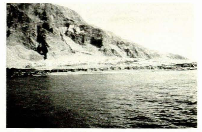
Fig. 2. The settlement of Edinburgh on Tristan da Cunha. The 1961 volcanic eruption occurred just to the left of the village.