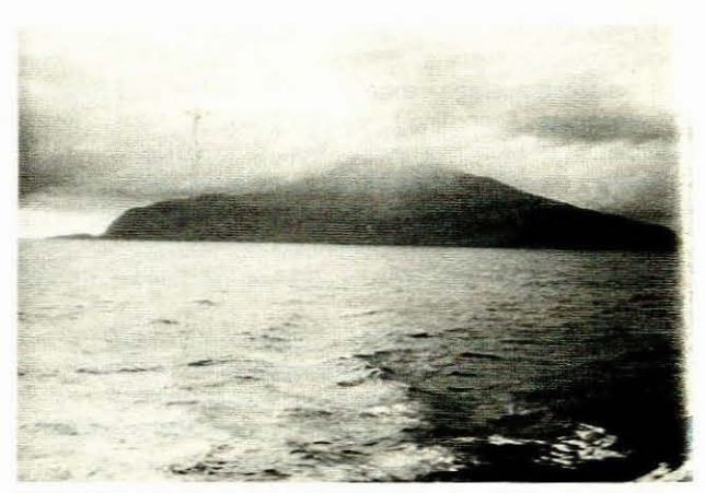
Fig 1. Tristan da Cunha from the south-west, with the 6 760-foot central peak obscured by cloud, and a small segment of the settlement plain visible on the left edge of the island.

The economy of Tristan da Cunha has gone through a number of phases; the community was initially fairly prosperous, supplying numerous American whaling ships with produce and bartering for essential supplies during the