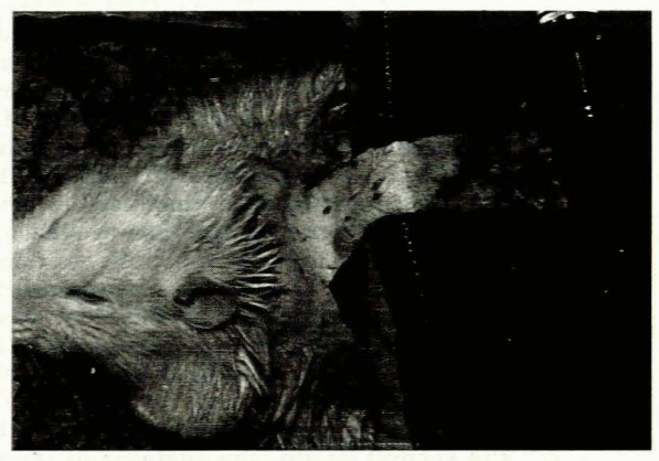
FIG. 3. Flap raised and partially de-epithelialised using wire bristle dermabrader.

Flap viability assessment in both groups was made clinically, histologically and by planimetry.