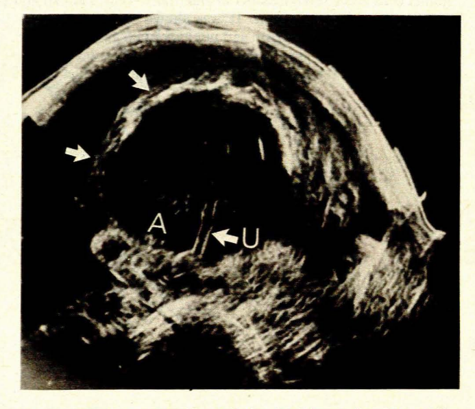
Fig. 2. Transverse scan through the fetal trunk showing ascites (A), the umbilical vein (U), more clearly seen than usual within the abdominal cavity because of the ascites, and oedema (arrowed).