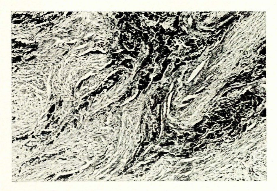
Fig. 3. High-power histological section showing invasion of muscularis by carcinoid cells.