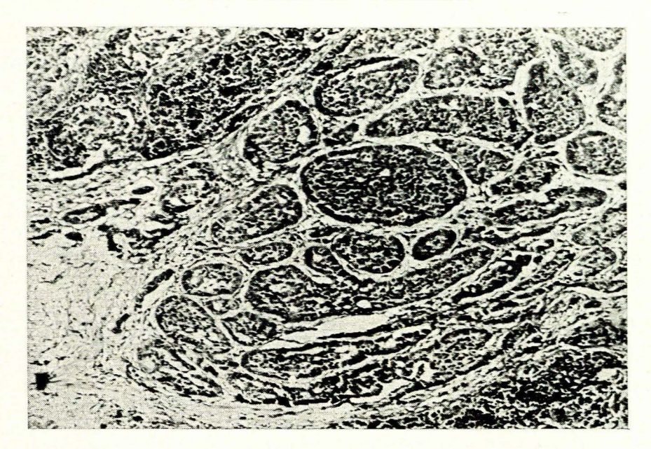
Fig. 2. Low-power histological section showing 'alveolar arrangement' of small round cells typical of carcinoid.