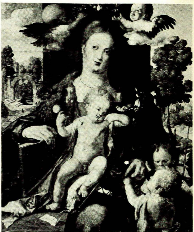
Fig. 1. Madonna and Child: Albrecht Dürer, 1506. Notwithstanding its large size, the rag bag is a dummy. There is, of course, no diaper, this being a product of the 19th century. It is very obvious that the infant Jesus is not circumcised (there is a long tradition in Germany of attempts at Aryanization of Jesus).

of a dummy as supplying sucking comfort, and sweet moisture or liquid as but a secondary phenomenon. True dummies can never be turned up by the spade of the archaeologist for they must have been made of linen and it is these linen bags which feature in the comments of Metlinger and Rosslin and the painting of Dürer.