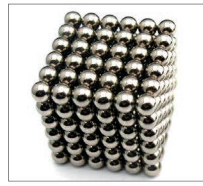
Fig. 3. Magnetic beads.