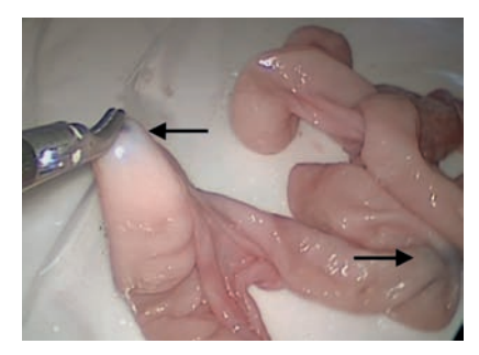
Fig. 5. Simulated model demonstrating attraction between the instrument tip and intraluminal magnet. Arrows indicate the position of the magnets.

and warns consumers to seek medical advice if ingested. Most are made of neodymium, iron and boron or other rare-earth metals and are extremely powerful magnets. The magnetic field typically produced by rareearth magnets can be in excess of 1.4 teslas. There have been product recalls on certain magnetic toys in the USA because of these issues; however, we are unaware of any such action in South Africa to date.