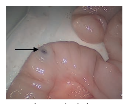
Fig. 4. Perforation in bowel after separation of magnets (arrow), caused by pressure of the attracting magnets.