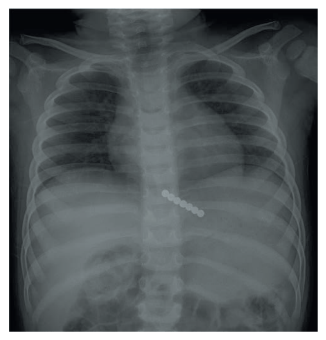
Fig. 1. Chest X-ray showing seven closely approximated beads in a 3-yearold child presenting with abdominal pain. The top two beads were in the oesophagus, while the remaining five were endoscopically retrieved from the fundus of the stomach.

Numerous magnet toys have been implicated in this growing problem, with an estimated 1 700 ingestions treated in emergency departments in the USA between January 2009 and December