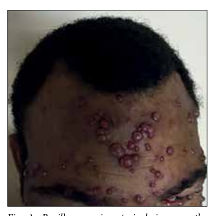
Fig. 1. Bacillary angiomatosis lesions on the forehead.

A diagnosis of bacillary angiomatosis is clinical and can be confirmed by serology, blood culture and histology. [1-3] It is difficult to culture Bartonella ; [1.2] serology cannot