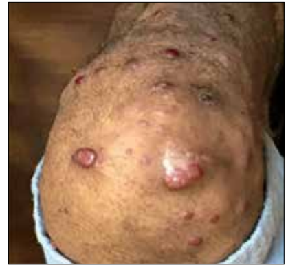
Fig. 4. Vascular lesions of bacillary angiomatosis on the right knee.