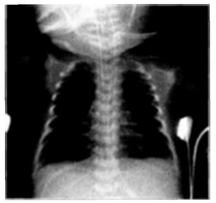
Fig. 1. Anteroposterior chest radiograph: No evidence for pneumothorax or pneumopericardium. An area of hyperlucency is noted behind/within the left cardiac border.

area a triangular shadow, representing aerated lung or free air, was present. A diagnosis of a pneumomediastinum and intracardiac air was entertained. The infant's clinical condition stabilised, but within 24 hours of birth he developed generalised myoclonic convulsive movements of all four limbs and was treated with phenobarbitone. The cranial ultrasound scan showed striking evidence of cerebral air embolism (Fig. 2), as manifested by an echogenic density in the right lateral