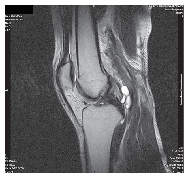
Fig. 2. MRI of the right knee showing the lobulated cyst in relation to the popliteal vessels.

adventitial cyst formation through micro-trauma. Our case illustrates that diagnosis is often difficult; symptoms developed gradually and the diagnostic focus was on the pre-existing venous outflow problems, while initially arterial disease was not demonstrated.