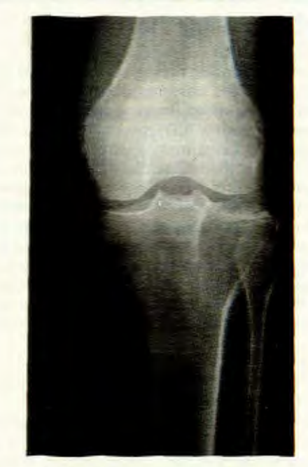
Fig. 1. Radiograph of the left knee showing a lytic lesion involving the lateral aspect of the tibial plateau.

In November 1998 he was admitted to his local hospital with a 1-year history of constipation, and was found to have faecal impaction. A barium enema was normal and he was treated with laxatives. He also complained of 3 - 4 months of pain in the left knee. A radiograph of the knee revealed a lytic lesion of the tibial plateau (Fig. 1) and a serum calcium level was found to be 3.63 mmol/l (normal 2.1 - 2.6 mmol/l). The urea level was 11 mmol/l and the creatinine level 319 µmol/l. A diagnosis of metastatic prostatic carcinoma resulting in hypercalcaemia was considered, but thought to be unlikely as the tibial lesion was lytic rather than sclerotic. The patient was therefore referred to us with possible primary hyperparathyroidism.