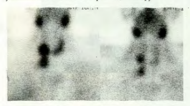
Fig. 3. TC99<sup>sestamibi</sup> parathyroid scan showing two areas of abnormally hyperfunctioning tissue in the region of the right lower pole of the thyroid and another just inferior to that area.

Tc99<sup>m</sup> sestamibi parathyroid scan showed two areas of abnormally hyperfunctioning tissue in the region of the right lower pole of the thyroid and another just inferior to that area, compatible with hyperfunctioning parathyroid tissue (Fig. 3). The patient was referred for parathyroidectomy. Histological examination revealed a right inferior parathyroid gland neoplasm but it was unclear whether this was benign or malignant. Postoperatively the PTH and calcium levels remained persistently elevated at 1 045 pg/ml and 3.1 mmol/l respectively, while the sick euthyroid and gonadotroph syndromes resolved without replacement therapy.