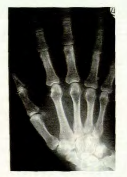
Fig. 2. Radiograph of the left hand showing subperiostial resorption and lesions compatible with brown tumours involving the third metacarpal and proximal phalanx, and the proximal phalanx of the thumb.

Tc99<sup>m</sup> sestamibi parathyroid scan showed two areas of abnormally hyperfunctioning tissue in the region of the right lower pole of the thyroid and another just inferior to that area, compatible with hyperfunctioning parathyroid tissue (Fig. 3). The patient was referred for parathyroidectomy. Histological examination revealed a right inferior parathyroid gland neoplasm but it was unclear whether this was benign or malignant. Postoperatively the PTH and calcium levels remained persistently elevated at 1 045 pg/ml and 3.1 mmol/l respectively, while the sick euthyroid and gonadotroph syndromes resolved without replacement therapy.