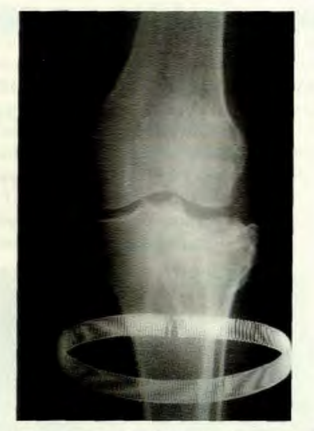
Fig. 4. Repeat radiograph of the left knee showing filling of the previously lucent area involving the tibial plateau.