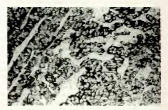
Fig. 3. Strong immunostaining for synaptophysin, confirming the neuroendocrine nature of the carcinomatous lesion, which also exhibits conspicuous trabecular morphology.

been proposed that these neoplasms may arise from cells containing neuroendocrine granules that are demonstrable in 20% of normal cervices.<sup>7</sup> Albores-Saavedra and associates reported the first case in 1972, namely a primary carcinoid of the uterine cervix.<sup>47</sup> However, cervical neuroendocrine carcinomas other than those of the small-cell type have received little attention and were not recognised as a specific entity in the World Health Organisation (WHO) classification, except for the category of 'carcinoid tumour'.<sup>7</sup>